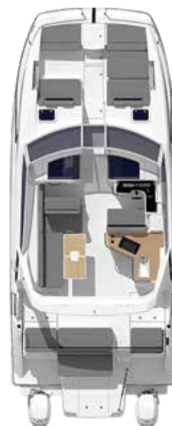
STANDARD MAIN DECK