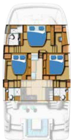
STANDARD 3 CABIN