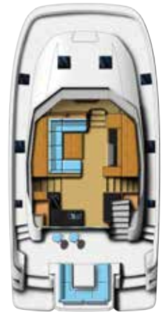
STANDARD MAIN DECK

All specifications and options are subject to change by Sino Eagle Yachts at their sole discretion. Performance is purely indicative and not a contractual commitment. Performance is subject to many variances outside the control of Sino Eagle Yachts. Specifications and graphics in this brochure are non binding and customer must enter into contractual agreement with the Dealer or Agent of Record.